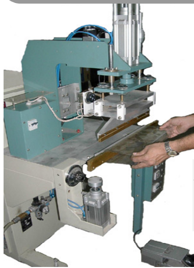
Sheet Welding with Sleeveboard under-electrode and Cylinder as mechanical Support

Please, send us your drawing or samples in order to test the welding of your products.