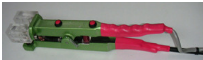
Mobile Clamp with Spring for repairing on Trucks or Light Working Ref: 67220-pince Eyelets